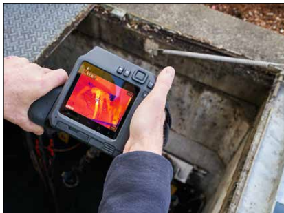
Up to 161,472 pixel resolution for accurate readings on distant targets