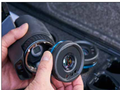
Share lenses (wide angle to telephoto) across your fleet of cameras thanks to AutoCal™ optics