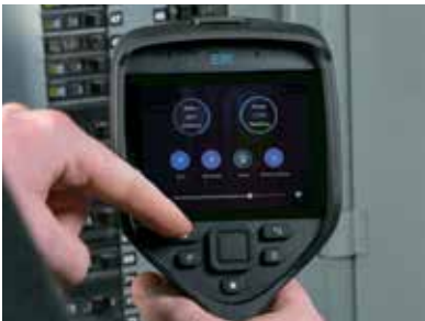
Streamlined data collection and sharing speeds analysis and repairs