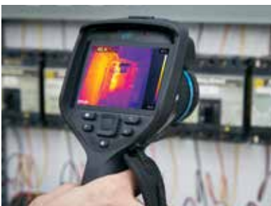
One-handed operation with convenient buttons helps maintain workplace safety